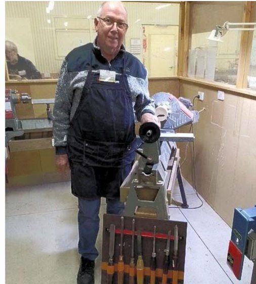
Dick is making a magnetic lathe tool rack to hold gouges and tools for each wood lathes