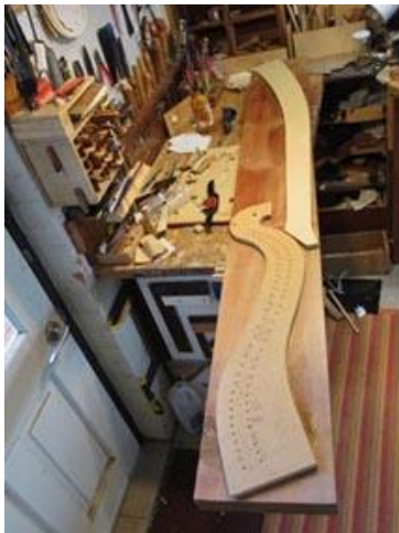
Neck and pillar templates. Plank: Tasmanian leatherwood 235 x 43 x 1900

The sound board under load will deflect upwards to 7 – 9 mm.