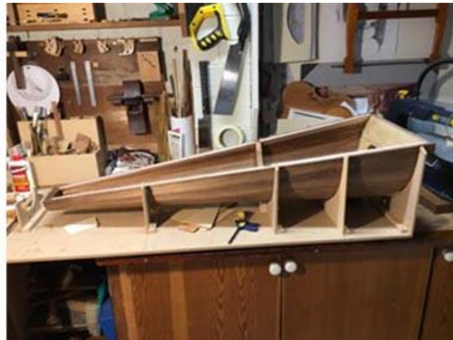
Sound shell construction - "stave back". Staves from 10mm Tas. blackwood