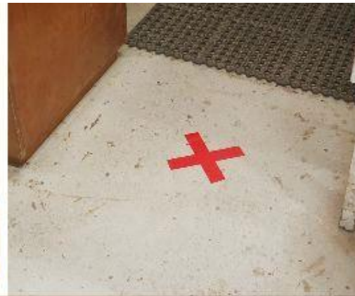
Not a workstation