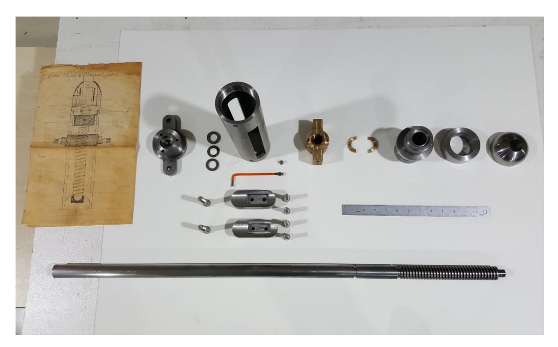
An fine example of high tolerance milling and lathe work shown by John B in the fabrication from scratch of a Shed project