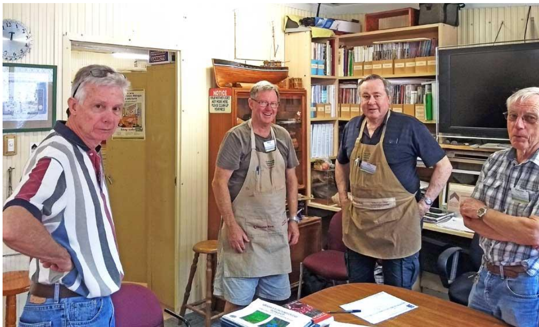
First meeting of the Shed Bushcare group. This group will begin the task of replanting the bushland surrounding the Shed. This will utilise our Bushcare plan to plant trees and grasses native to the area.